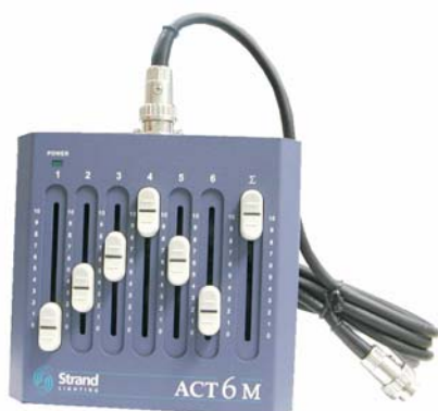
64311 Act 6 Digital Fader Panel